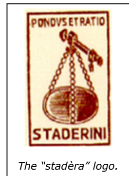
The "stadèra" logo.